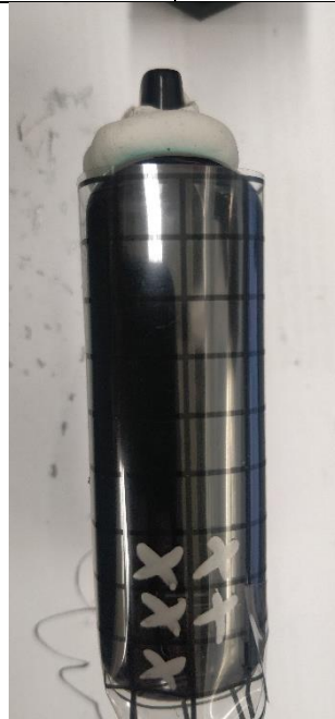
Right side view