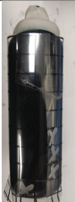
Left side view